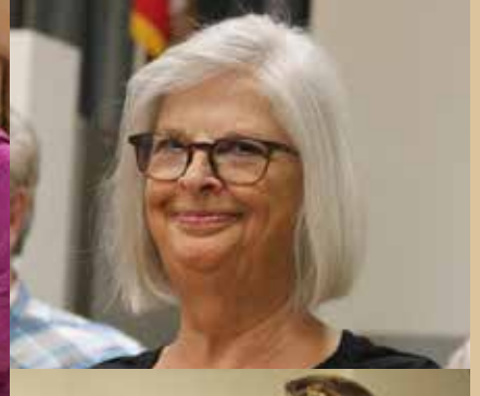
VJ Ladies Model Their Poinsettia Skirts.